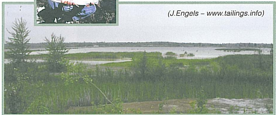
A reclaimed tailings pond in Sudbury, Ontario, Canada.

before development, former tailings ponds can become lakes capable of supporting fish populations. Land areas become revegetated and provide habitat for local wildlife.