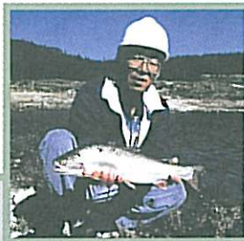
A trophy rainbow trout fishery has been established at a reclaimed tailings pond at the Highland Valley Mine in British Columbia, Canada.

Once water in the tailings pond is safe, it can be reconnected to the natural water system through a series of channels and streams. In this way, water balance in the area can be re-established. Depending on environmental conditions