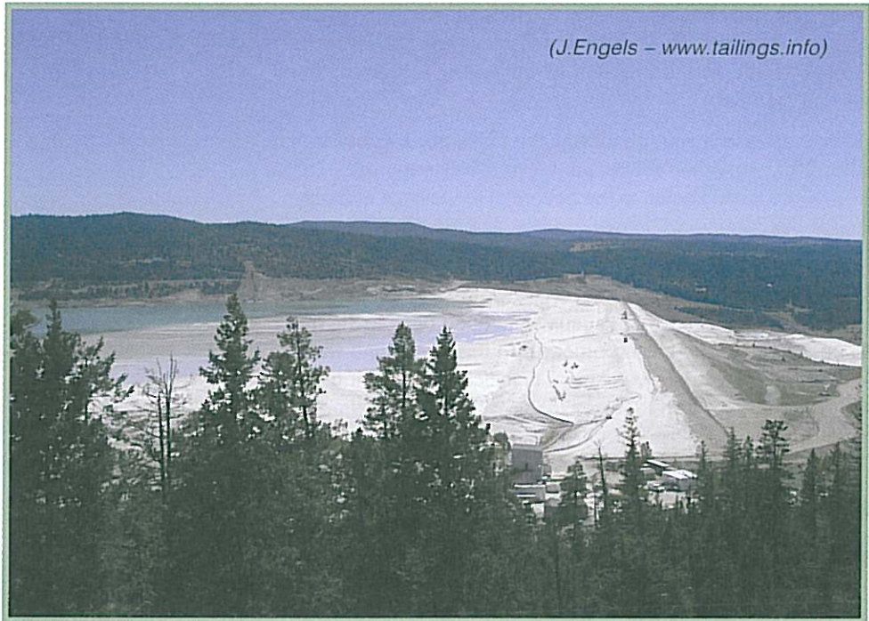
A tailings storage facility at the Highland Valley Mine in British Columbia.

This backgrounder is intended to provide Pebble Project stakeholders with an understanding of the issues and considerations for tailings management.