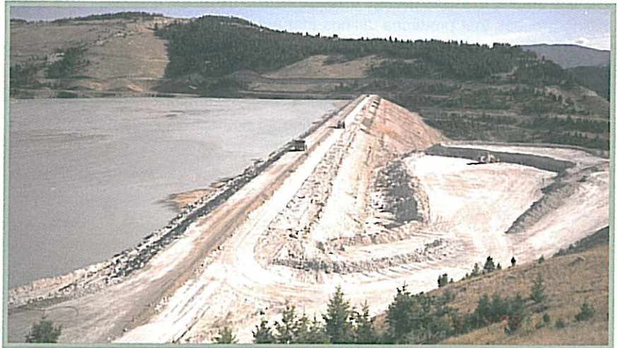
A tailings embankment – or barrier – is usually built at the low end of a valley to contain tailings material. (A tailings embankment near Jefferson City, Montana.)

As the volume of tailings material contained in the storage area grows, so too must the height of the tailings embankment and the elevation of the tailings pipeline. Each stage of the process is carefully planned, highly engineered and carefully scrutinized by state and federal experts.