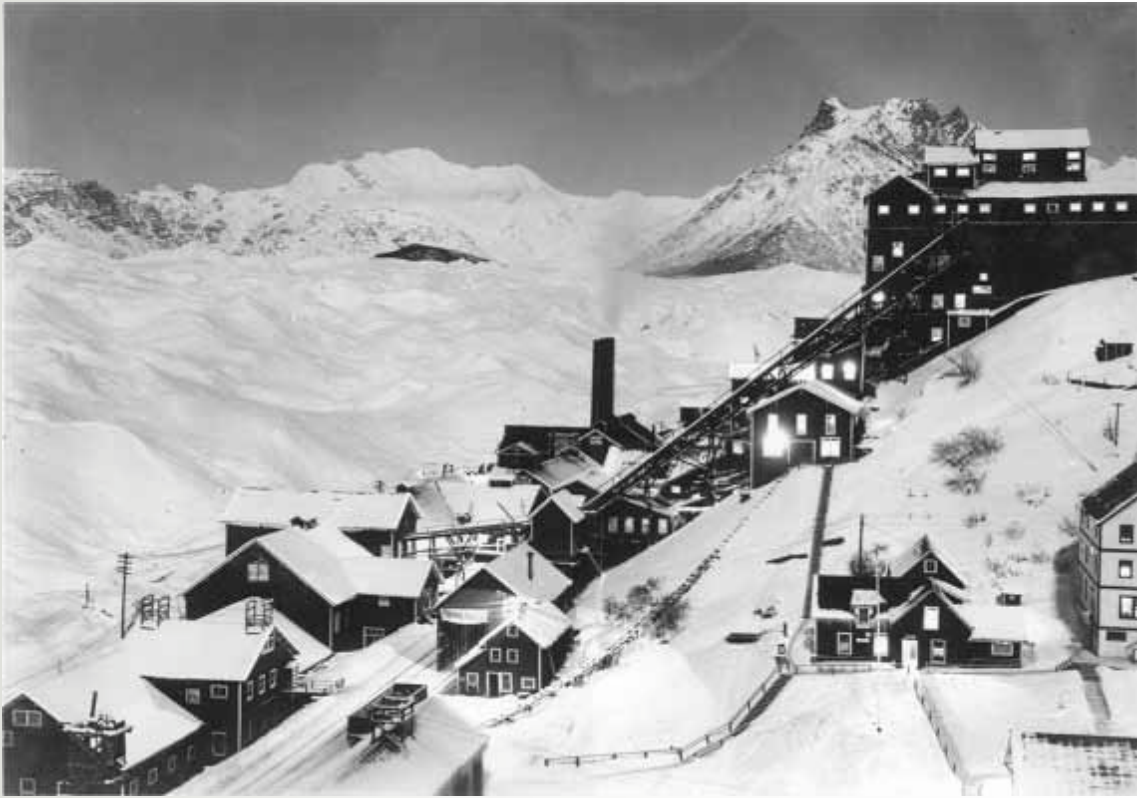
Image of Kennecott Mine power plant and facilities with the Root Glacier in the background, Kennecott Mines National Historic Landmark, Wrangell -St. Elias National Park and Preserve, McCarthy, Alaska. Photo and history of the mine available from www.nps.gov/wrst/images/20060705142735.JPG . Kennecott is considered the best example of early 20th Century copper mining.