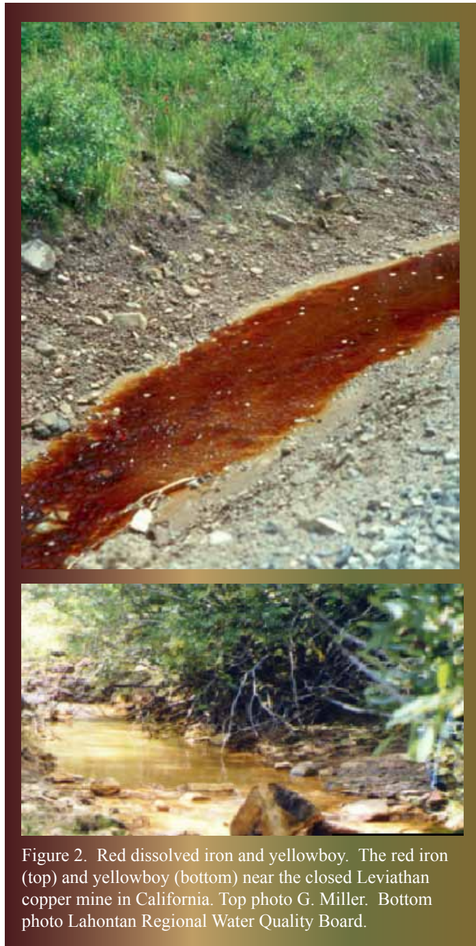
Figure 2. Red dissolved iron and yellowboy. The red iron (top) and yellowboy (bottom) near the closed Leviathan copper mine in California.

Dissolved aluminum also becomes solid in natural waters, forming mucus-like streamers that clog fish gills and cause fish to suffocate.