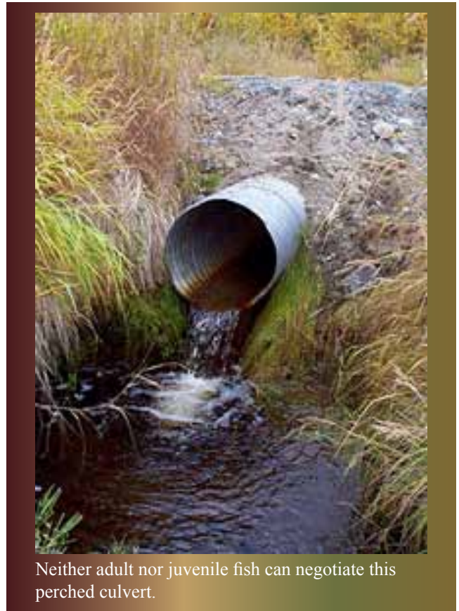
Neither adult nor juvenile fish can negotiate this perched culvert.