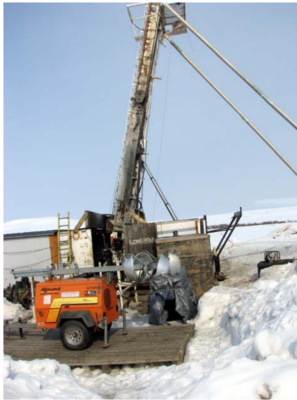
Figure 1. Rig no. 1 on drill site no.8405. Note tundra pad.