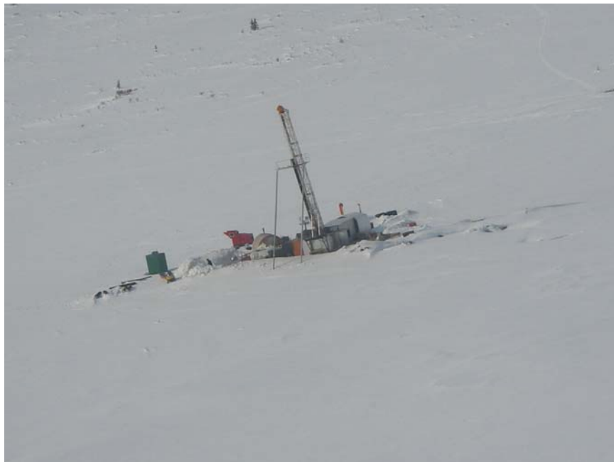
Figure 6. Drill site 8405, rig no. 1.