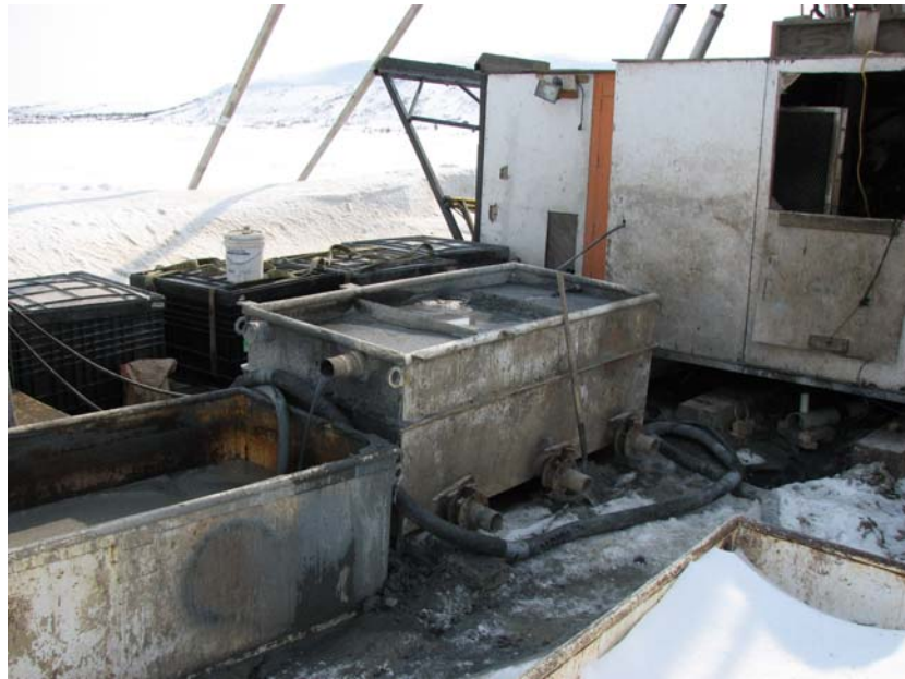
Figure 3. Drilling mud recirculation system, rig no. 1.