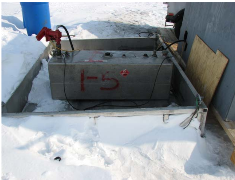
Figure 2. Secondary catch basin for pump fuel tank, rig no. 1 water source.