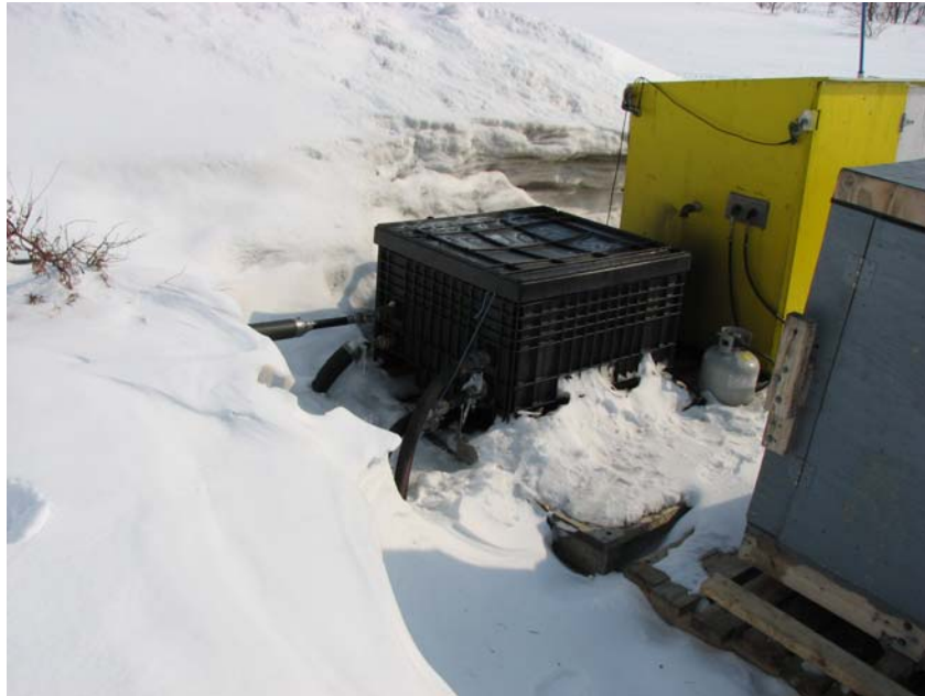
Figure 5. Circulation tank at water source location for rig no. 2