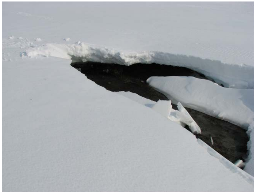
Figure 4. Rig no. 1 bypass water discharged to tundra.