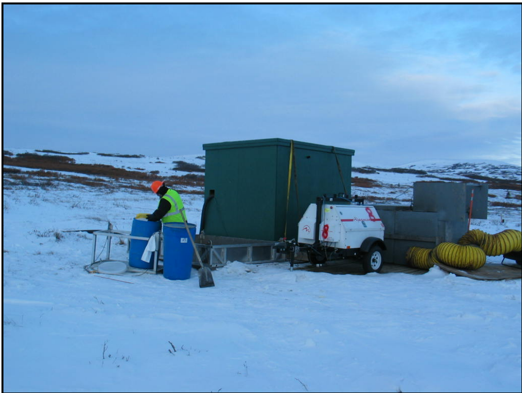
Photo #8. Crew member changing out spill kit at water pump for drill #1.