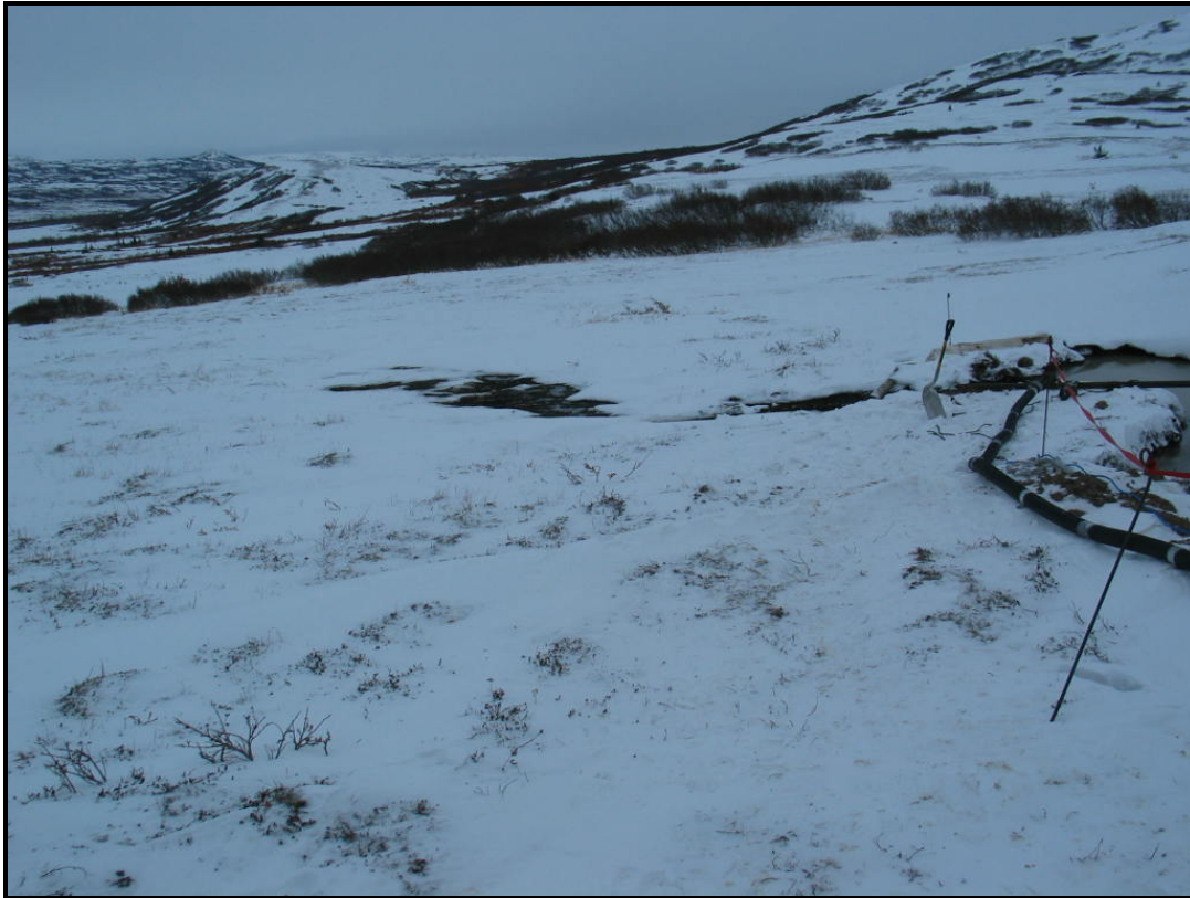
Photo #27. Fluid discharge extends approximately 200' downhill from drill #5.