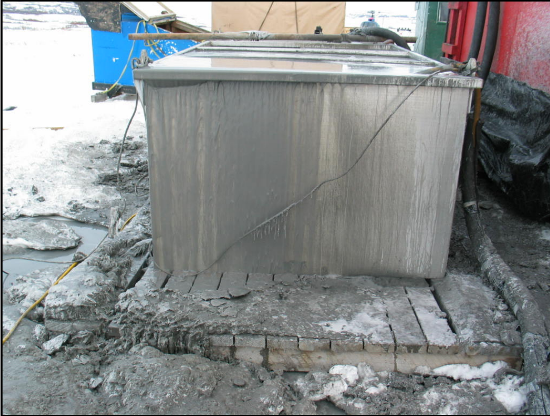
Photo #13. Drilling mud overflowing from recirculation tank at drill #2.