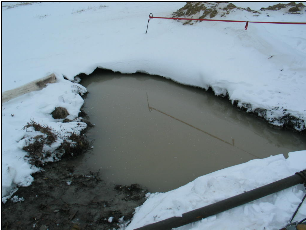
Photo #26. One of two sump pits at drill #5. Outflow is to bottom left of photo.