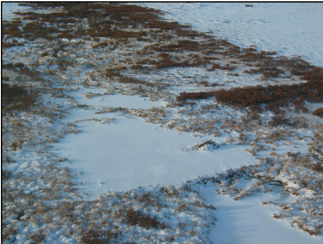
Photo #4. Beaver pond and lodge in uppermost South Fork Kaktuli drainage, above Frying Pan Lake.