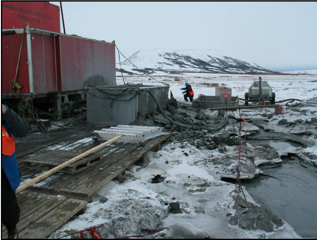
Photo #29. Sump pits and recirculation tank at Drill #6. Mud was overflowing from the tank into the pits, but none was leaving the sumps.