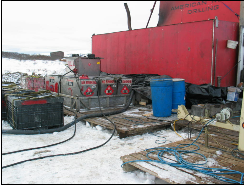
Photo #9. Fuel and containment at drill #2. Spill kit and scrubber barrel are in place.