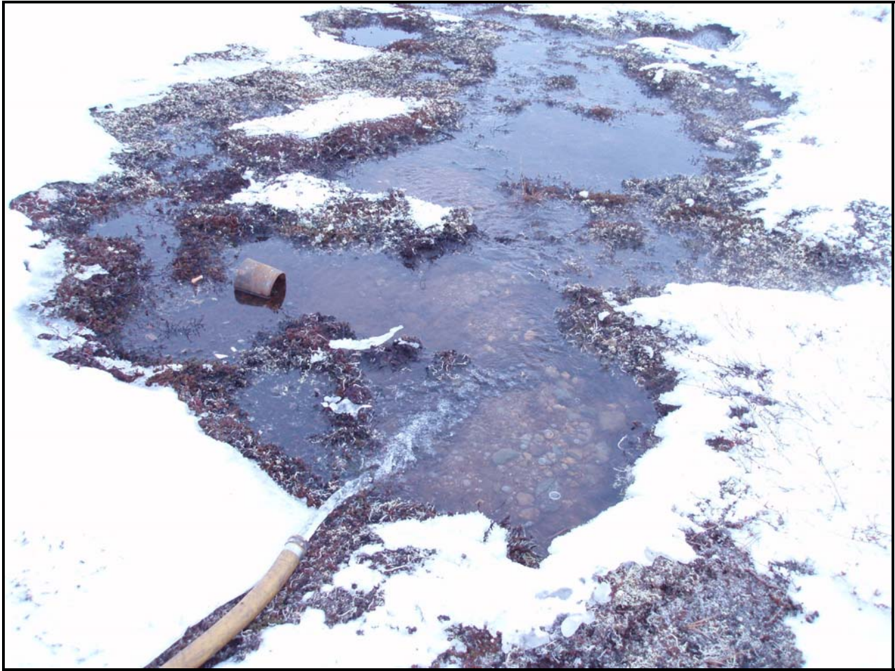
Photo #32. Excess water being discharged onto the tundra at drill #6.