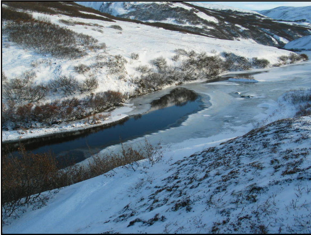
Photo #3. South Fork Kaktuli River immediately below Frying Pan Lake.