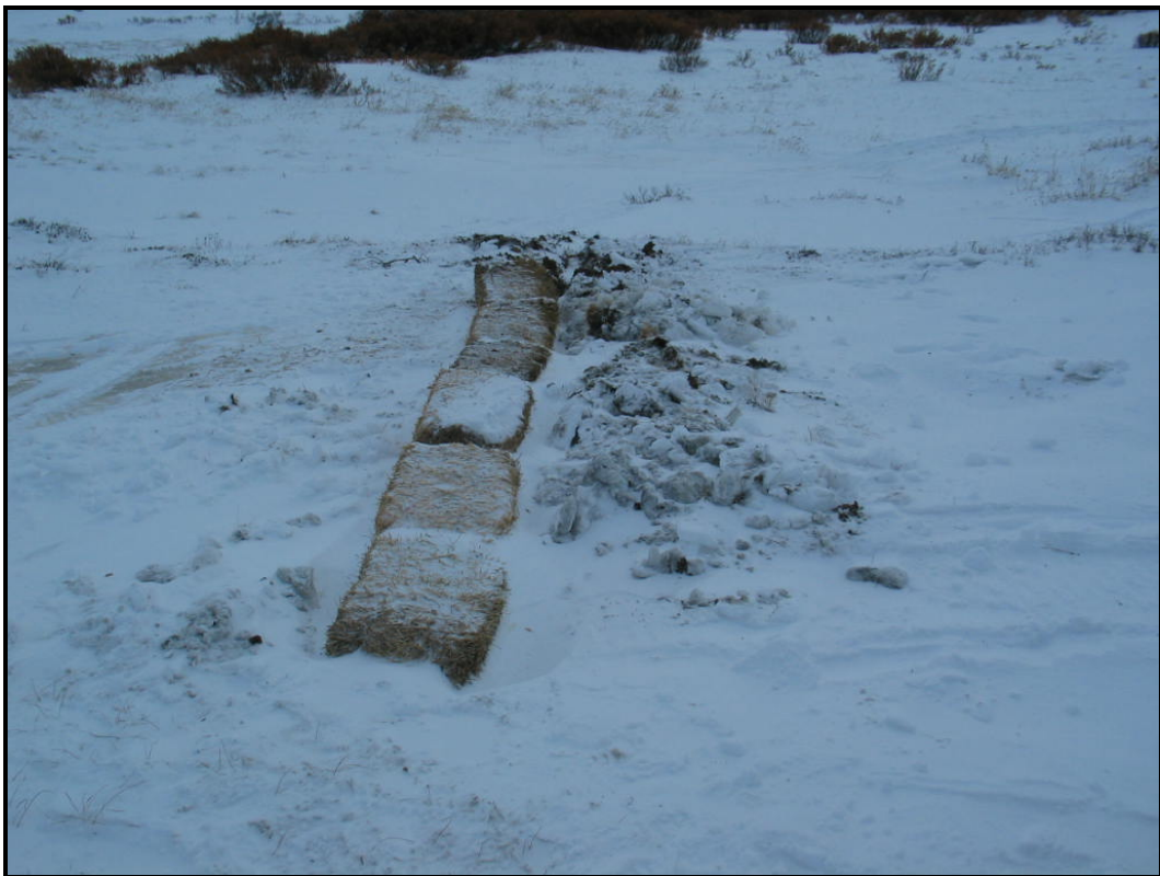
Photo #12. Straw bales placed to block flow of discharge toward pond.