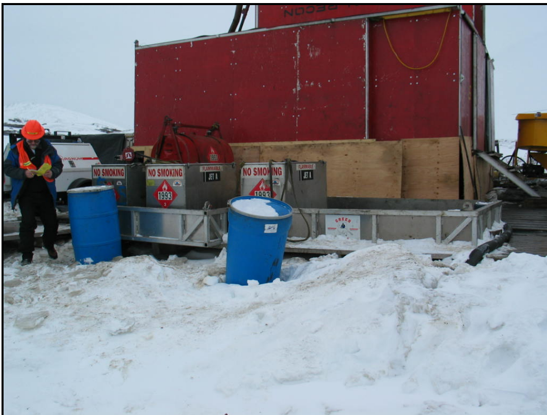
Photo #24. Chris Foley, of DEC, inspecting fuel containment at Drill #5.