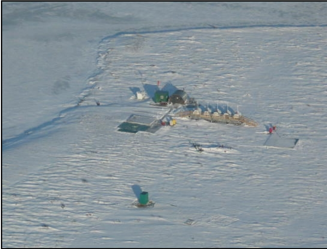
Photo #1. Big Wiggly fuel storage. Not in use at time of inspection.