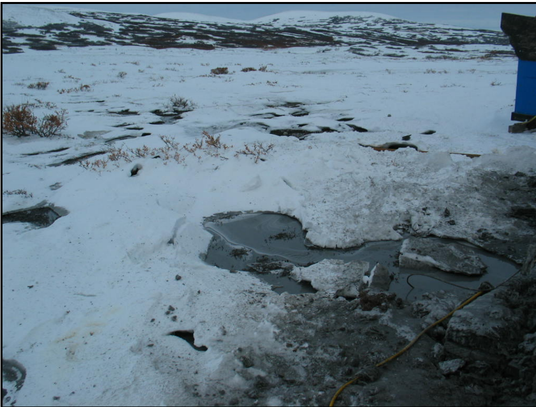
Photo #14. Fluid discharge from recirculation tank onto ground on west side of drill #2.